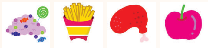
A B C D